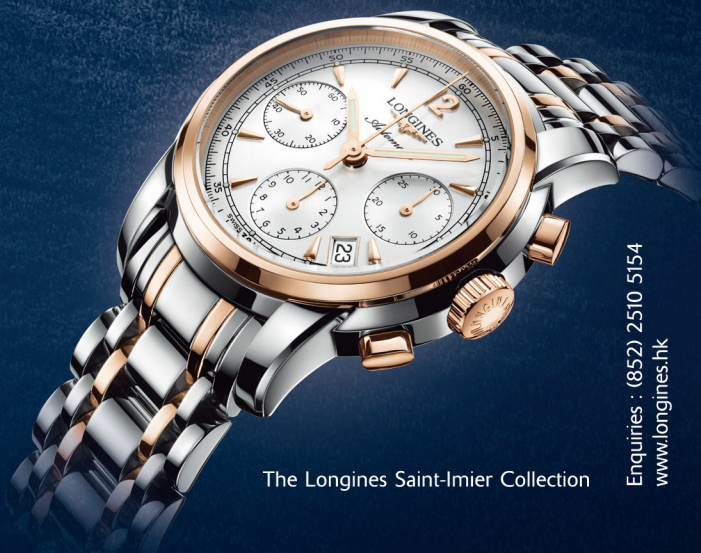
The Longines Saint-Imier Collection

Enquiries : (852) 2510 5154 www.longines.hk