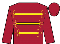
THE LIR JET