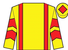
LOUIE DE PALMA