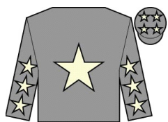
GABRIAL THE WIRE