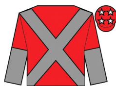
PASS THE VINO