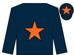
ARMY OF INDIA