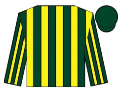
THUNDER OF NIAGARA