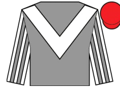
DUKE OF FIRENZE