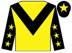
BLUE DE VEGA