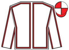
ON TO VICTORY