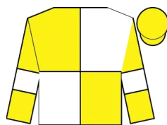
DASH OF SPICE