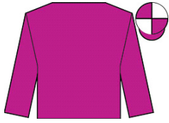
KING OF STEEL