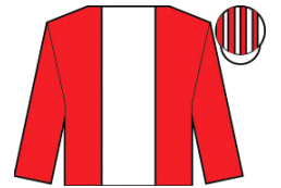
ROCHA DO LEAO