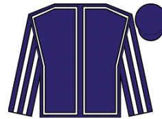
RED RIDING HOOD