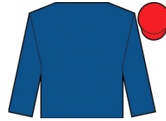
LIVE YOUR DREAM