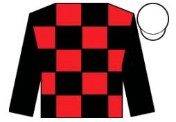
BLUE FOR YOU