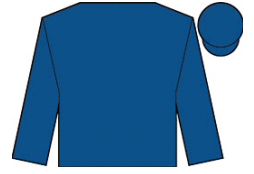
KING OF CONQUEST